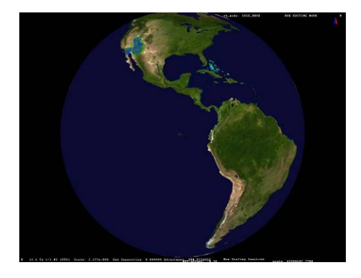
Screenshot of VGIS at startup.