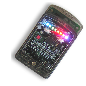
Figure 1: The Sun Microsystems SunSPOT

Persistent query networks, in their current form, are not easily adapted for use with the multitude of situations that they seem suitable for. One of the reasons for this is that a true persistent query is typically a very taxing operation. The PAQ Middleware aims to solve this issue. The goal of our research was to understand why the PAQ Middleware is useful and then to show this through development of a museum monitoring application. Once developed, the application would serve as a baseline for future tests. We also tried to show that PAQ should be considered socially relevant because of its many advantages not only to the applications programmer but to the end user as well.